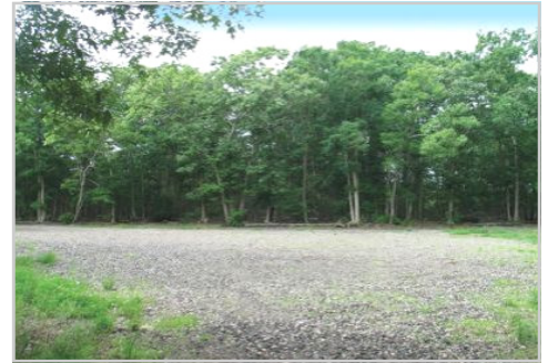
Approx. 23,000 Sq. Ft.