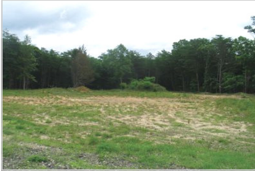
Approx. 1 1/2 Acres