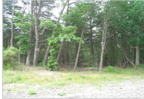
Approx. 42,000 Sq. Ft.