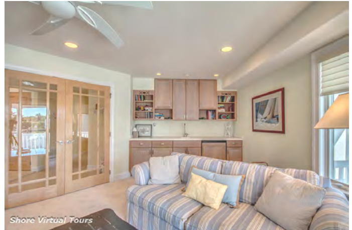
Another view of the first floor family room with wet bar and access to front deck