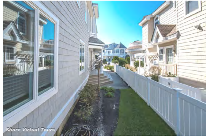
Nicely landscaped with grass yard