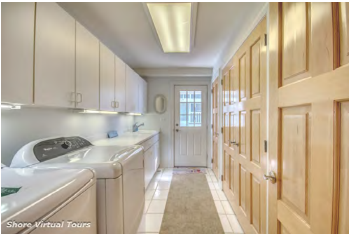
First floor utility room with washer, dryer, sink, plenty of cabinets, and counterspace