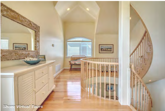
Second floor landing area With Hardwood Floors and Cathedral Ceiling