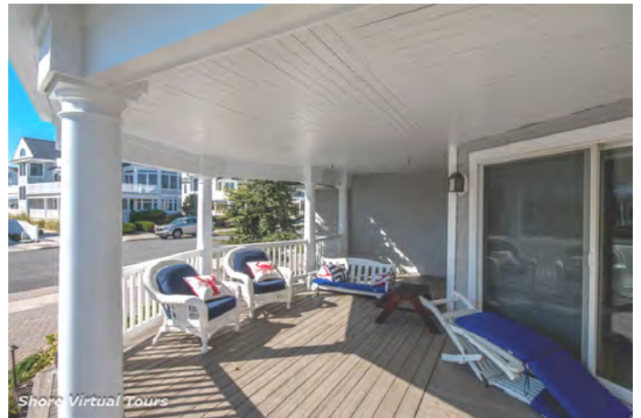
First Floor Front Deck