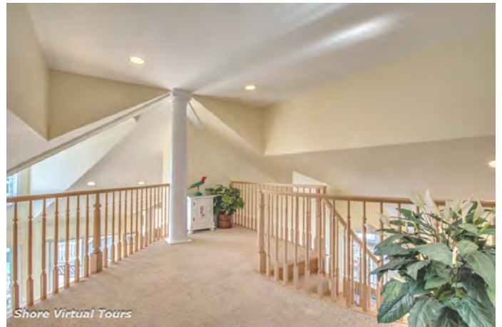
Third floor landing area To Master Bedroom Suite

Open Area Off Stairwell from 1st to 3rd Floors