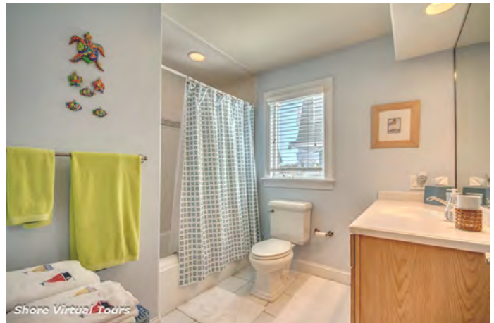
First floor bathroom with tub, tile floor, and recessed lighting

Ceiling Fans & Recessed Lighting Throughout Home