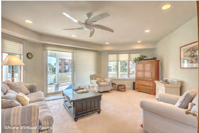
Spacious first floor family room with wall-to-wall carpeting, ceiling fan, recessed lighting, and access to front deck