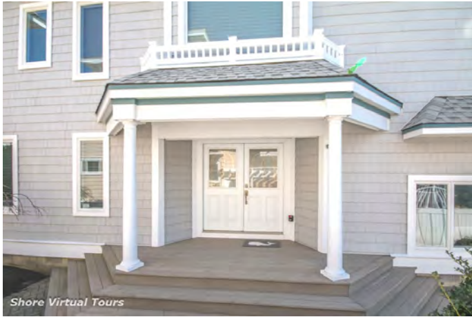
Entrance to home with paver walkway