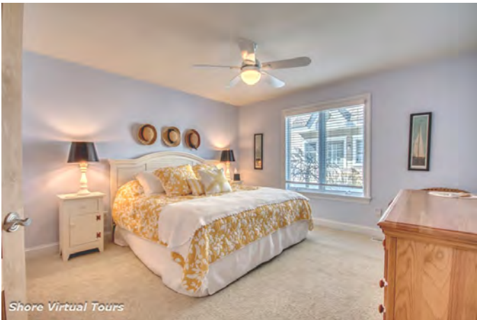
First Floor South Bedroom With wall-to-wall carpeting And Ceiling Fan