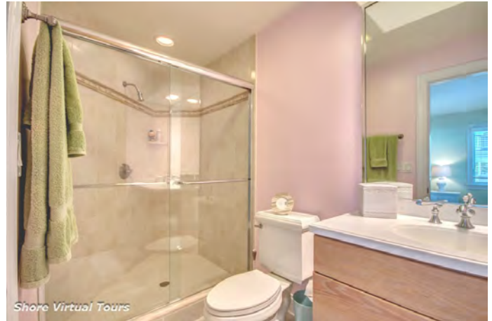
Private Bathroom for First Floor East Bedroom with Walk-in Shower And Tile Flooring