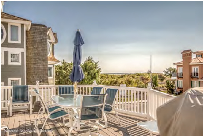
View from Second Floor Deck