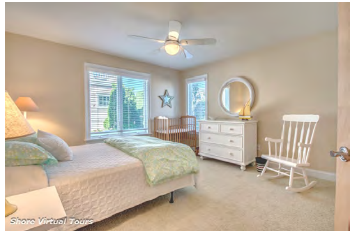
First Floor Northwest Bedroom With wall-to-wall carpeting And Ceiling Fan

All bedrooms are attractively decorated wall-to-wall carpeting and ceiling fan