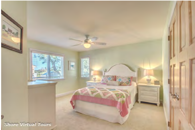
First Floor East Bedroom With Private Bath Wall-to-wall Carpeting & Ceiling Fan